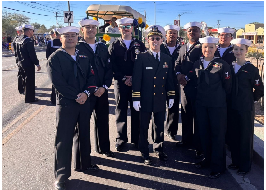
USS Tucson submariners roll with retiree colleagues in the 2026 Tucson Rodeo Parade, February